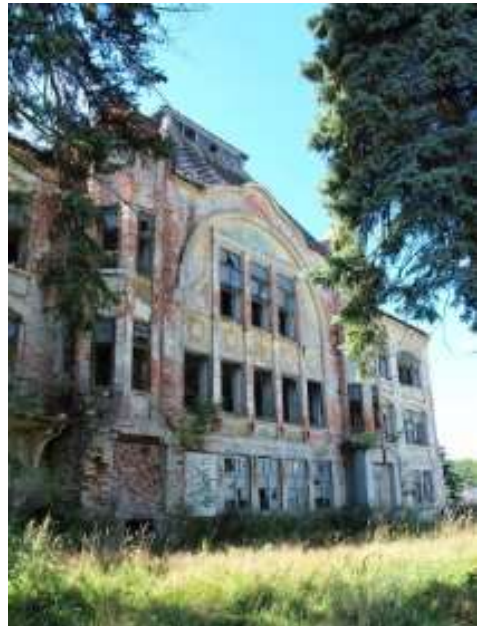
Elias Palme Factory, Kamenicky Senov